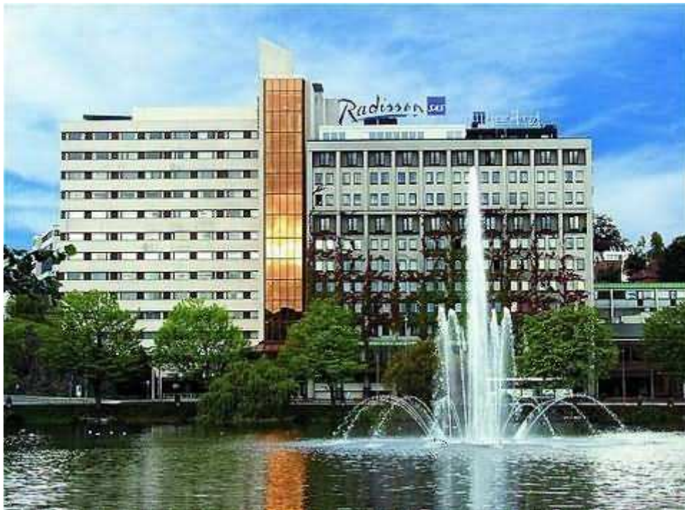
Hotel where you will be staying. Beautiful sight to town!

Unpack, relax or take a walk through Gamle Stavanger . At 1500 the officers from the local ISU branch will meet you at the Hotel's lobby. Make sure to be on time.